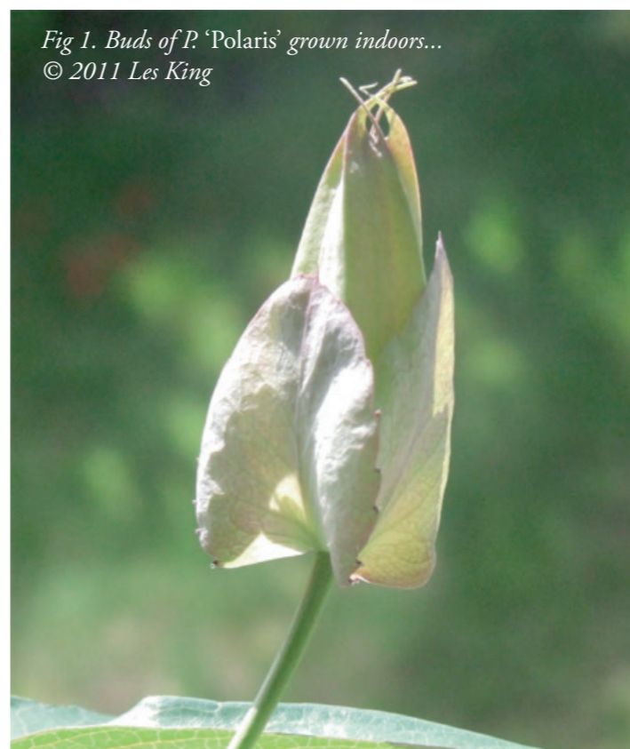
Fig 1. Buds of P. 'Polaris' grown indoors...