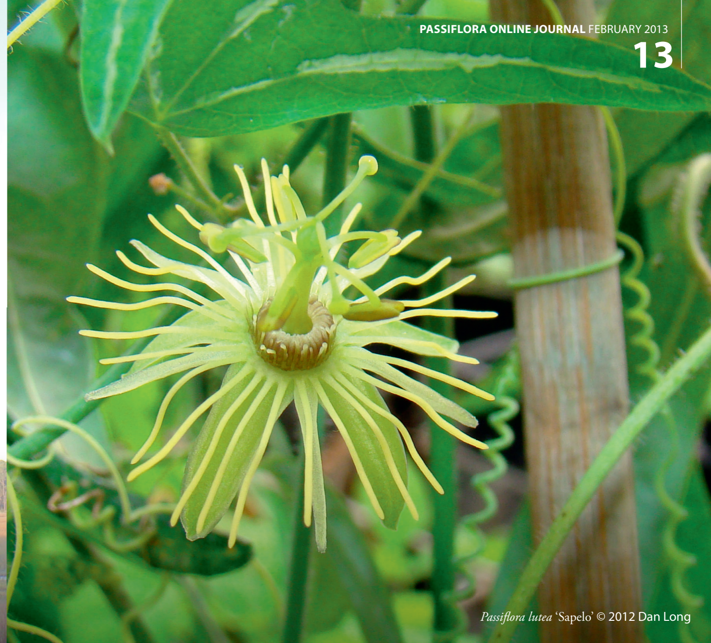
Passiflora lutea 'Sapelo'

We've been very busy these last few years moving the family and nursery to a new home in Georgia, USA. Most every day involved running the business or building nursery structures. In the middle of all that I had a long weekend away with the family camping on a little island off the coast of my new home state. Sapelo Island is a quiet place with access only by ferry boat and very few tourists are allowed. It has an interesting history involving enterprising wealthy plantation owners and others. There's a small population of descendants of former slaves that live on the island and a marine research facility. There are some interesting things to see so the group we camped with rented a pickup truck from one of the residents and we went adventuring away from the campground. Naturally, while bouncing around in the back of a beat up pickup on sand and oyster shell roads, I didn't see much. We stopped and saw an old plantation or two and a couple of lighthouses. Then we went off the road into the woods to see a prehistoric Native American site called a shell midden. Essentially, it's a giant ring of old shells 80 feet across and up to 10 feet high. It was abandoned hundreds of years ago at least, so it's completely overgrown. Archaeologists know it was man made and they lived inside the ring in pre-Columbian times. The purpose of the ring is debated. Some theorize it was a defensive work against