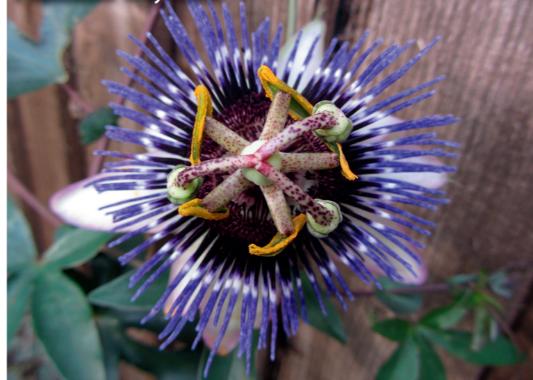
Passiflora ‘Silly Cow’

You may download, display, print and reproduce this material in unaltered form only for your personal or non-commercial use. You may not use this material on a web site or publish it in any way, whether for personal, educational, commercial or non-commercial purposes, without permission.