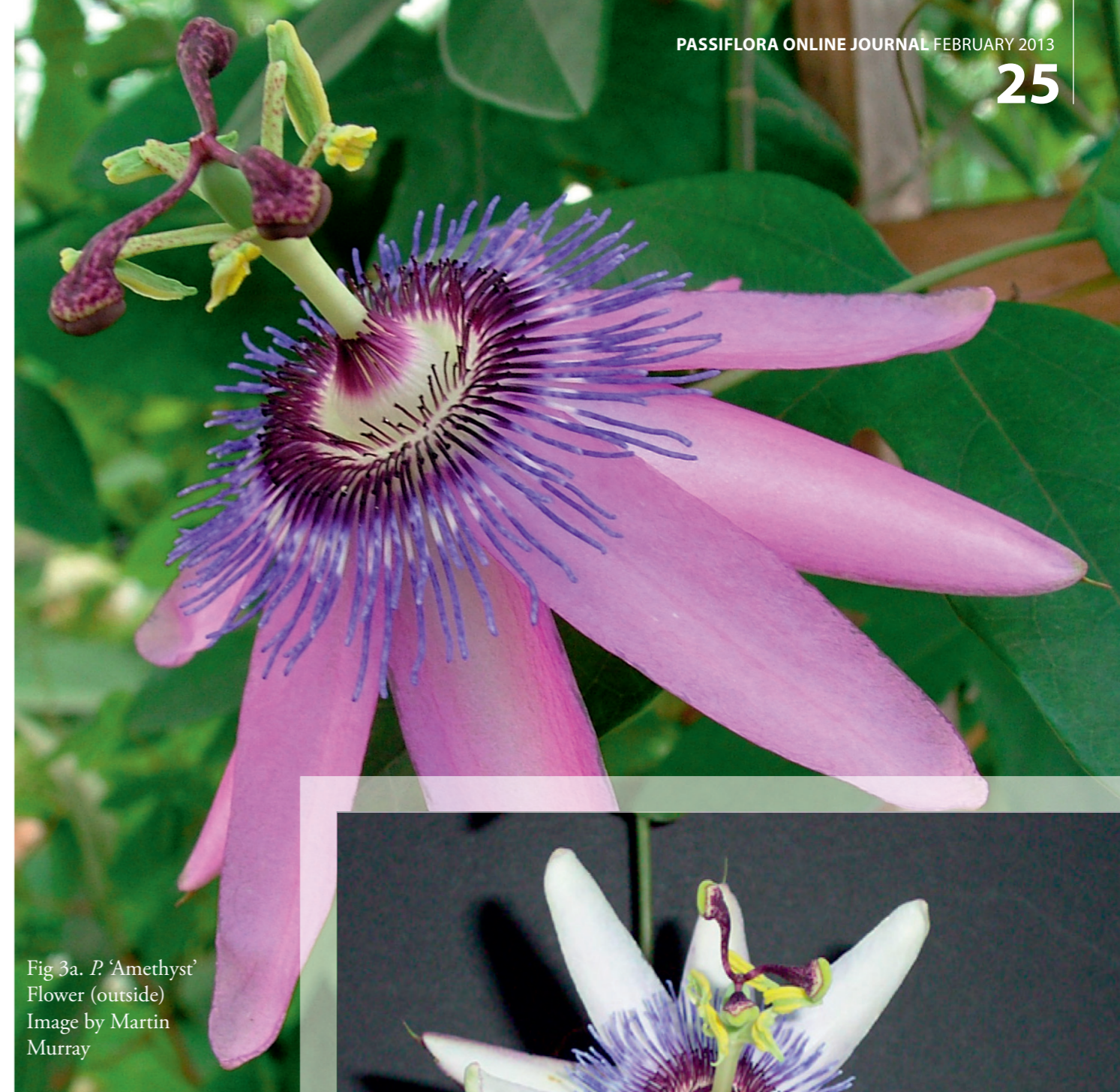
Fig 3a. P. 'Amethyst' Flower (outside)

In P. 'Amethyst', a different form of colour variation can be unambiguously associated with temperature. Flowers that develop late in the year in cold weather exhibit white petals and sepals (see Figure 3). This is not a function of low light levels in winter months since plants grown in winter in a heated conservatory have a normal colour.