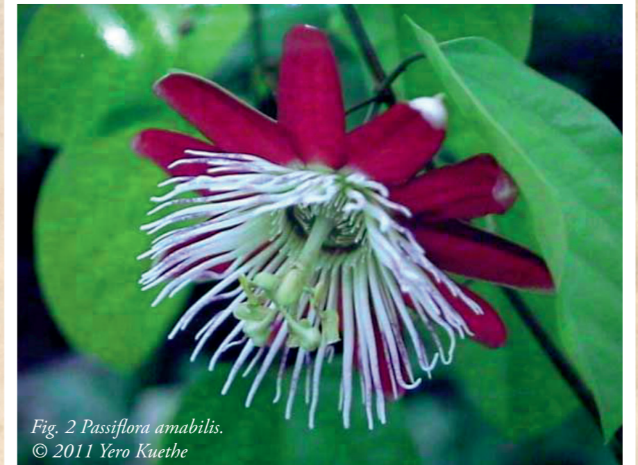
Fig. 2 Passiflora amabilis.