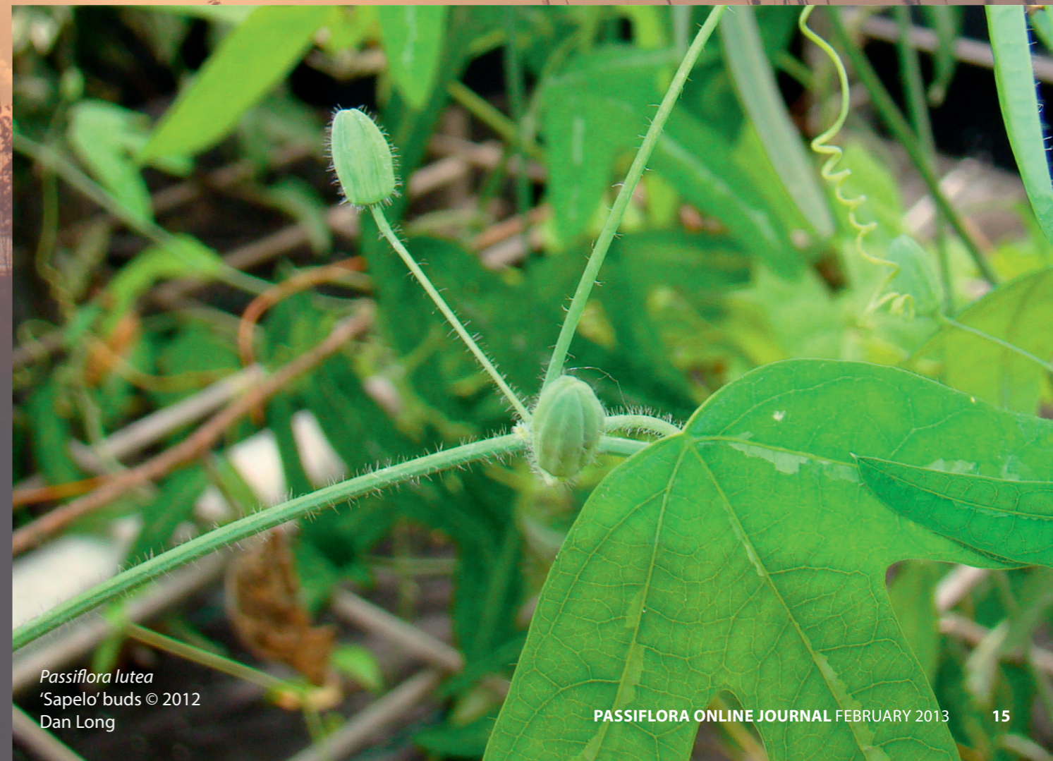
Passiflora lutea 'Sapelo' buds