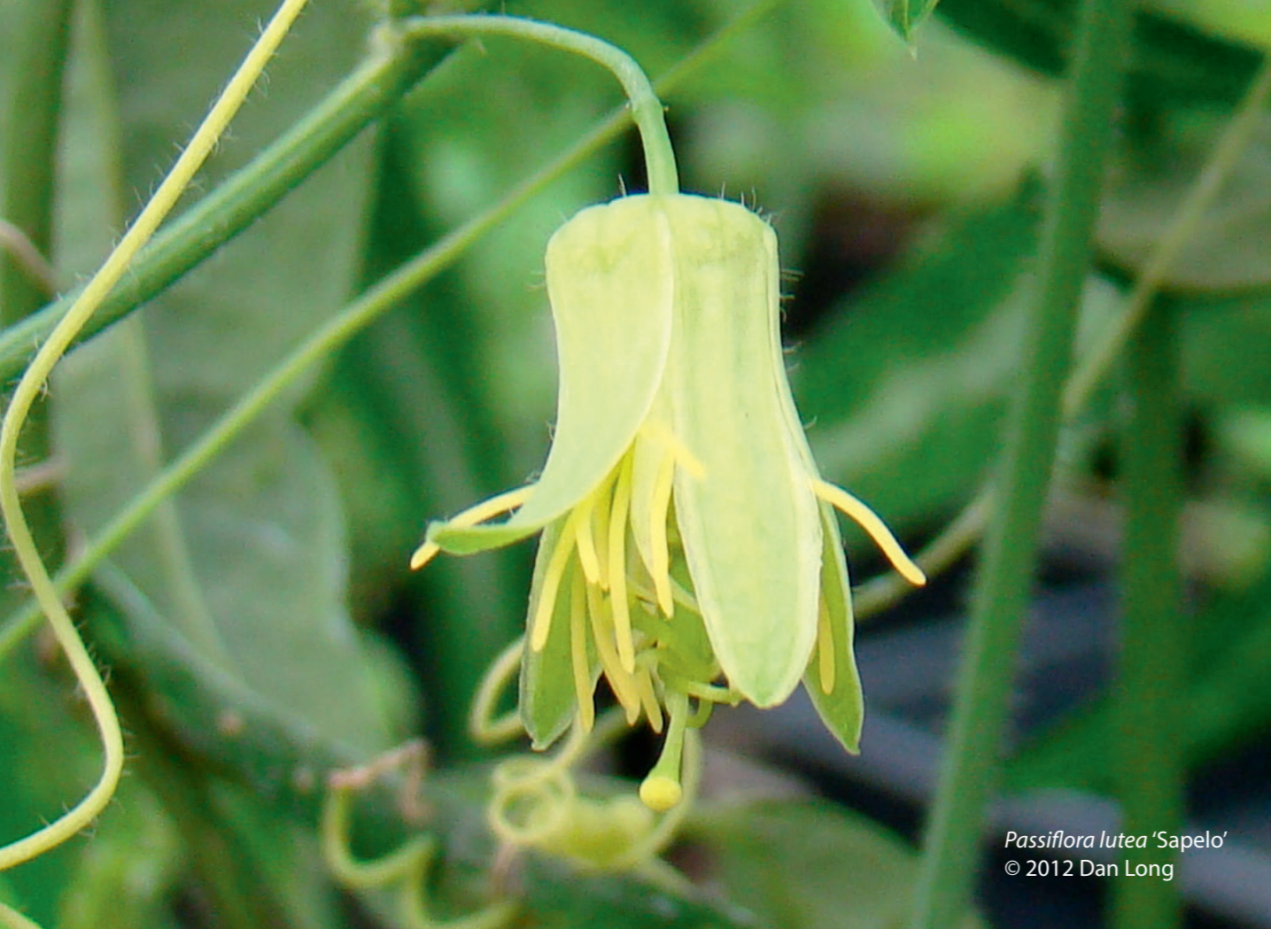
Passiflora lutea 'Sapelo'