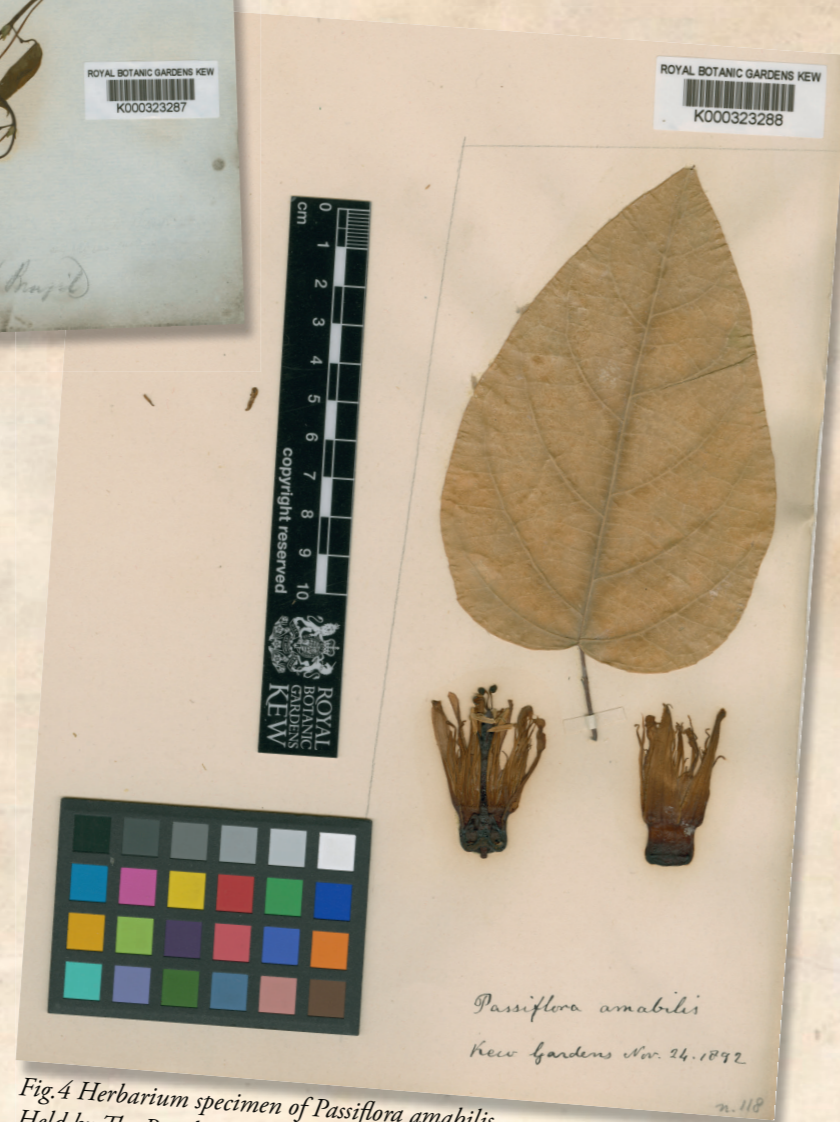
Fig. 4 Herbarium specimen of Passiflora amabilis . Held by The Royal Botanic Gardens, Kew.