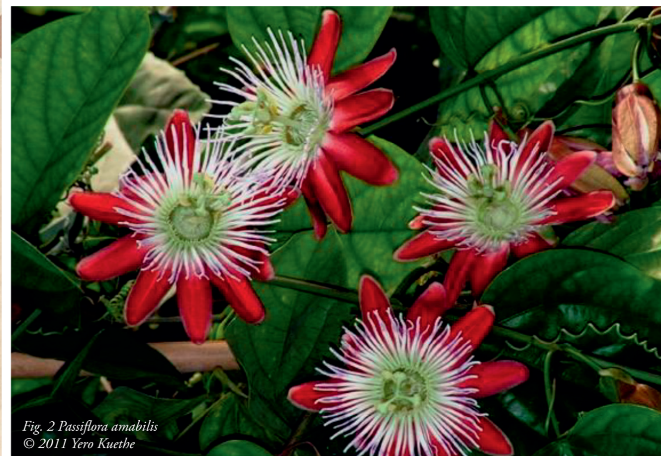
Fig. 2 Passiflora amabilis

in Brazil collected their needs from the nearby forests, perhaps only growing crops of commercial value, like P. alata for their fruit or as herbs. P. racemosa is not commercially valued for its fruit, but for its decorative flowers and may have been cultivated by enthusiasts who admired the unique racemes back in the 1840's. The chances that the two species actually hybridized in that time are slim, but possible. More detailed and professional observation of the natural population is necessary to confirm this theory. Till then, we will struggle to establish the facts from the options that are: