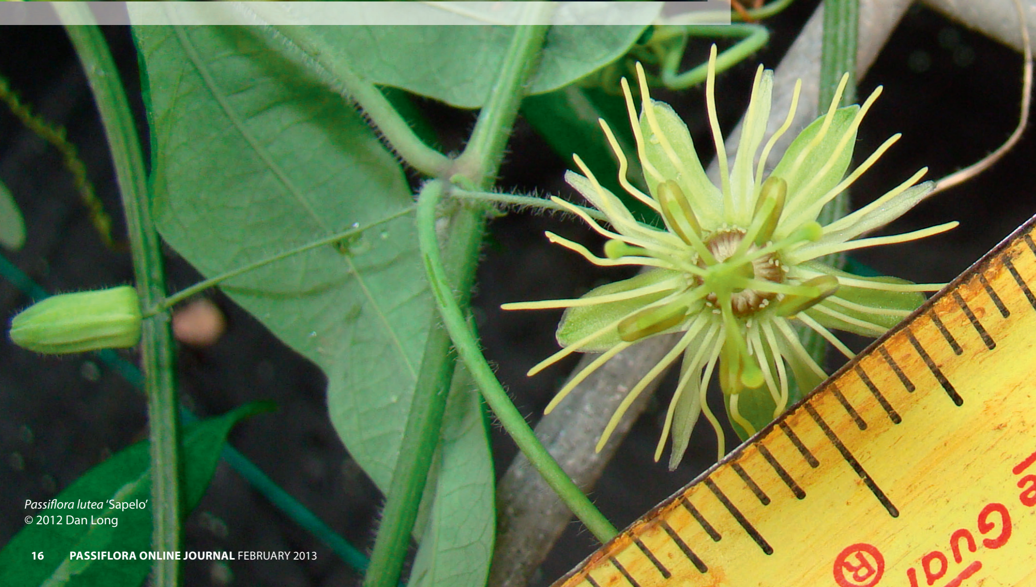
Passiflora lutea 'Sapelo'