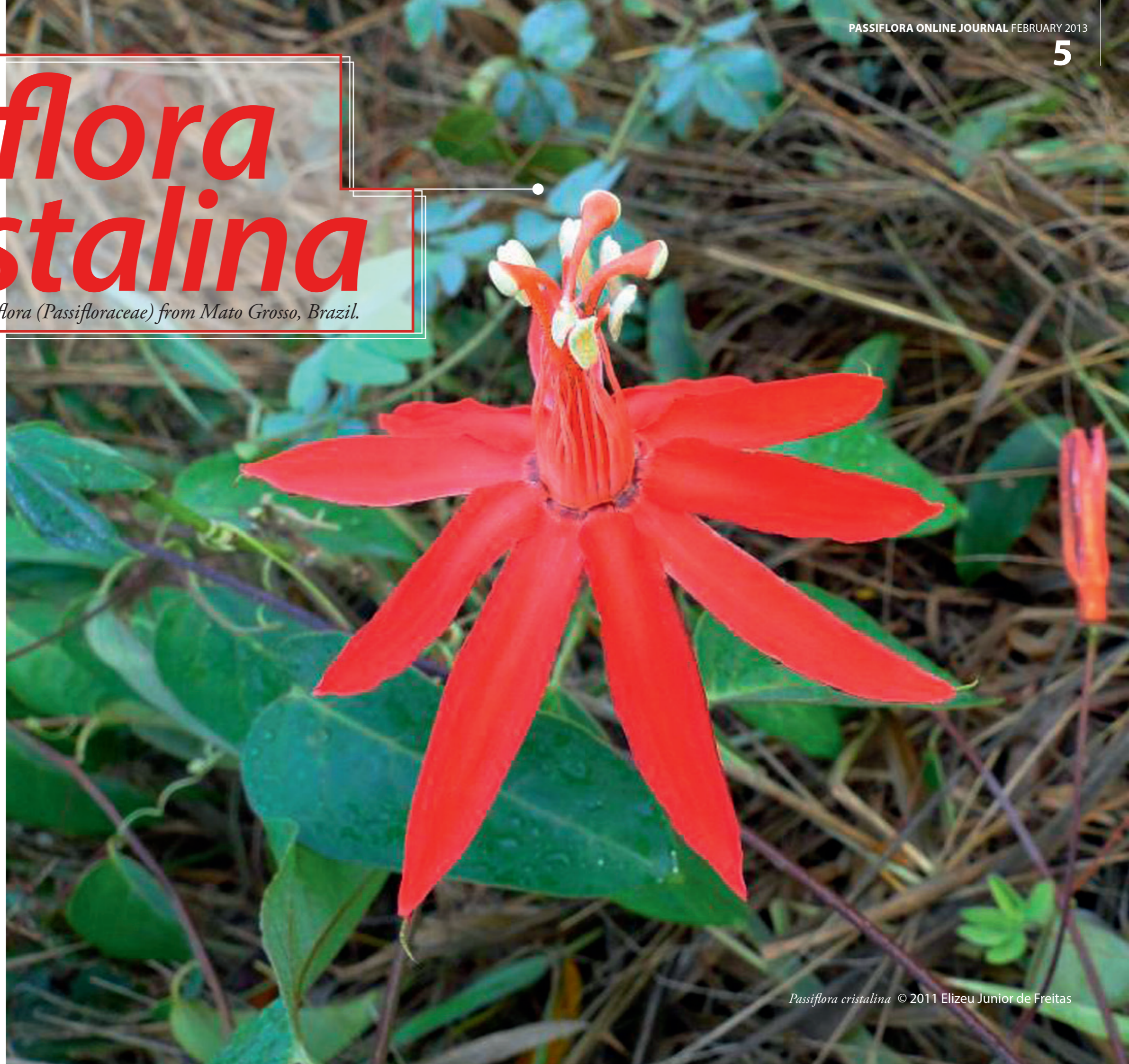
Passiflora cristalina

Passiflora L. is a genus of mostly perennial climbers, a few small trees, shrubs, herbaceous vines and even annuals comprising 537 species (Vanderplank 2007) which are divided into four subgenera, Astropheia (DC.) Mast., Deidamioides (Harms) Killip, Decaloba (DC.) Mast. and Passiflora L. (Feuillet & MacDougal 2004). Subgenus Passiflora is the largest with 252 species, which consists mainly of large and medium size vines with large, showy flowers endemic exclusively to the New World. In publications prior to 2004 virtually all the large red flowering species of the lowland tropical forests were placed in subgenus Distephana (Juss.) Killip (1938) which included well known species like P. coccinea Aubl. and P. vitifolia Kunth. In the new classification of 2004 Feuillet and J. M. MacDougal divided Distephana into two supersections, Coccinea and Distephana .