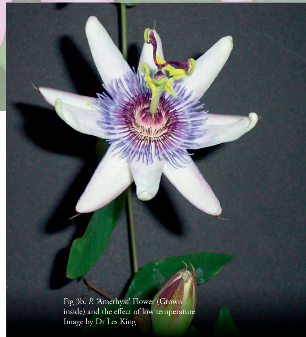
Fig 3b. P. 'Amethyst' Flower (Grown inside) and the effect of low temperature

Figure 3a shows the normal flowers of P. 'Amethyst'. Figure 3b shows the effect of low temperature on colour.