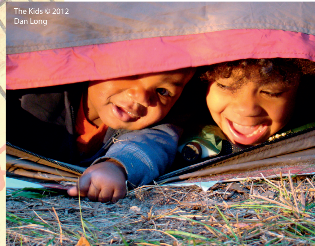
The Kids © 2012 Dan Long