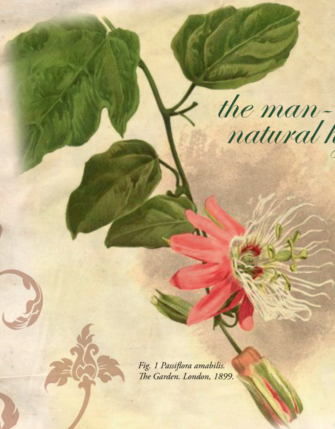
Fig. 1 Passiflora amabilis . The Garden. London, 1899.

Red flowered Passiflora are very popular with growers as they are so striking and P. amabilis fits the bill perfectly. The beautiful bright red flowers have a large white corona with a touch of purple, complimented by a sweet scent making it a must have for every Passiflora fanatic. The large green vine, with its nice ovate-lanceolate green leaves and easy flower production make P. amabilis a valued specimen for every botanical or private collection... but why has no one ever heard of it?